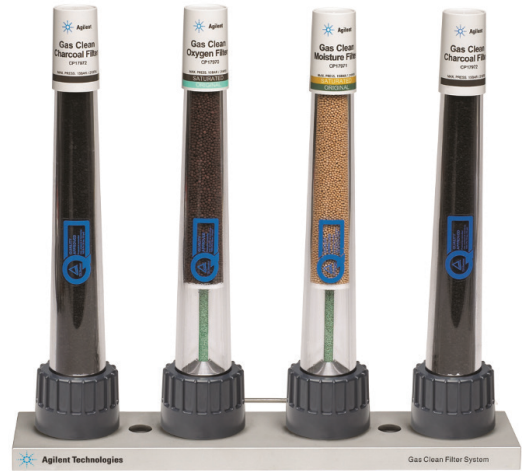
Figure 2. Agilent Gas Clean filters.

The Agilent Gas Clean filter system delivers clean gasses, reducing the risk of column damage, sensitivity loss, and instrument downtime. Inserting a Gas Clean filter system into the gas line immediately before the instrument inlet greatly reduces the level of impurities, and improves trace analysis. The sensitive indicators within the filter change color, alerting you that the filter needs to be replaced. Replacing the filters when they have reached absorption capacity ensures maximum protection of your GC columns and analytical hardware.