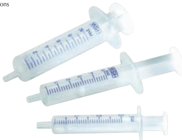
S7510-10 top, S7510-5 middle, S7510-3 bottom